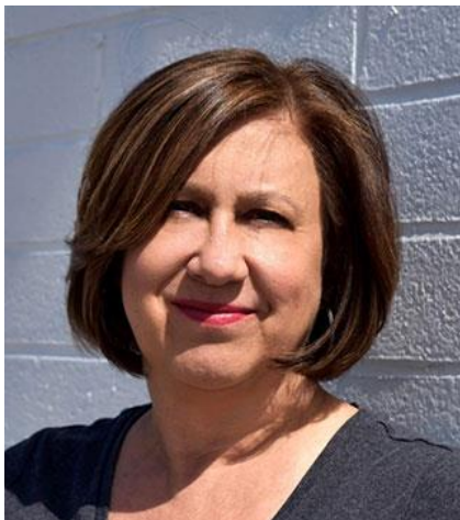
Alexandra Fleming Creative Writing